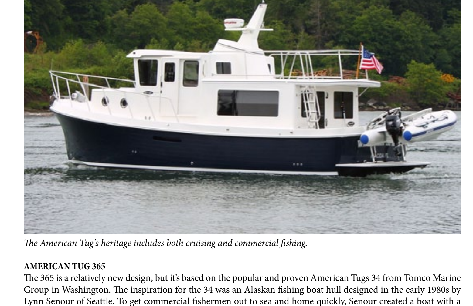
explorer-cruiser including a pair of panoramic windows in the salon. With an LOA of 36' 6", the 365 has two cabins and a convertible berth in the salon. Power ranges from 330 to 380 hp. With a 370-hp Volvo top speed is 18 knots.

wide beam of 13' 3". To increase the stability inherent in that beam and reduce roll, he added flat, sharp chines. The result was a fishing boat that could carry big loads and, with sufficient horsepower, scoot to fishing grounds and back to port. American Tug realized the design features that work for fishermen could work for recreational boaters, too, so they commissioned Senour to adapt that hull for their customers. The first American Tug 34 was launched in August 2000, and it found a loyal fan base. It's evolved to become the 365, with features that enrich its mission as