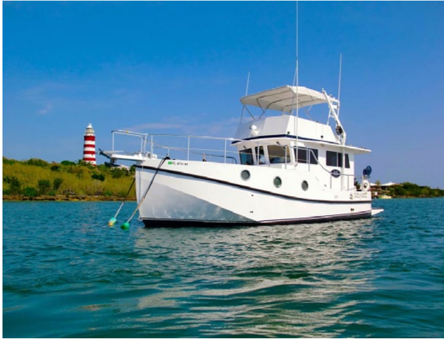
It's been called the ideal liveaboard boat, a trawler that couples an incredibly roomy interior with the reliability of a commercial workboat. We like its origins: The idea for the N37 came to Ken Fickett when he went search-

Trawlers are often associated with grand cruising plans, but you don't always need a yacht-sized model to achieve your dreams of traveling to distant ports in comfort and efficiency. There are plenty of models under 40 feet that can take you places without depleting the retirement savings account. Here are a few we like.