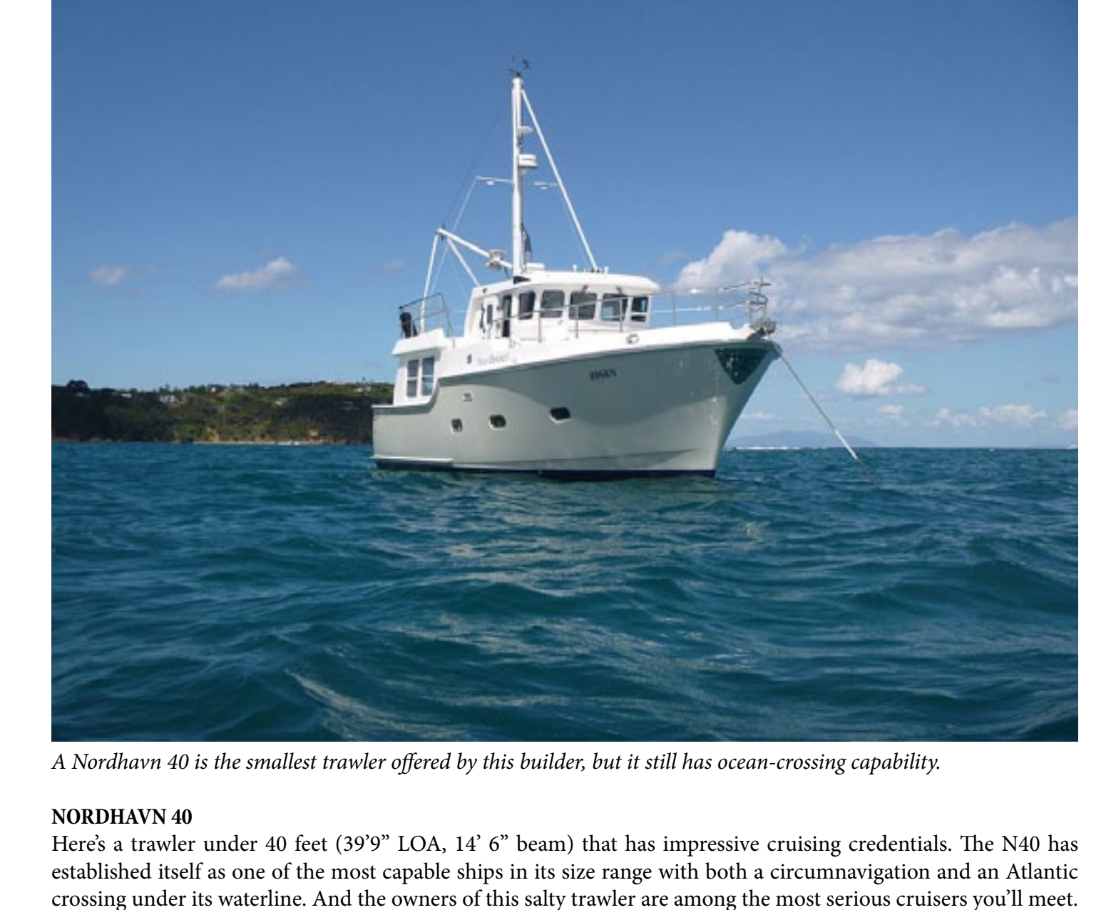
The N40 is the smallest model in the Nordhavn fleet of ocean-crossing motor vessels, so it has true offshore pedigree. It features a full displacement hull, a 900-gallon fuel capacity and range of 2,400 nautical miles at seven knots.

ing for a boat he could cruise aboard with his own family for a year. When he couldn't find what he wanted, he enlisted the help of naval architect Lou Codega, who helped Fickett design what would become the N37. This full-displacement model was the genesis for the Great Harbour series of trawlers built by Mirage Manufacturing in Gainesville, Florida. The robust build is a signature feature, with a cored superstructure and deck that possesses enough buoyancy to keep the vessel afloat if things get bad out there. It's powered by twin 54-hp diesels, too, which means you can steer a course off the beaten path knowing you'll be safe with a second get-home engine. Standard tankage gives the GH37 a range of 1,500 nautical miles. That Maine-to-Miami range is complemented by an interior suited for long stays aboard. There are three decks of living space, and accommodations include an owner's and guest stateroom. LOA is 36'10"; beam is 15'10". Read our full review: Great Harbor N37: A Trawler for Two.